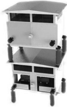
外观图形 Appearance Graphics